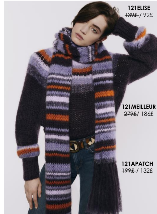
121EILISE 139€ - / 92£