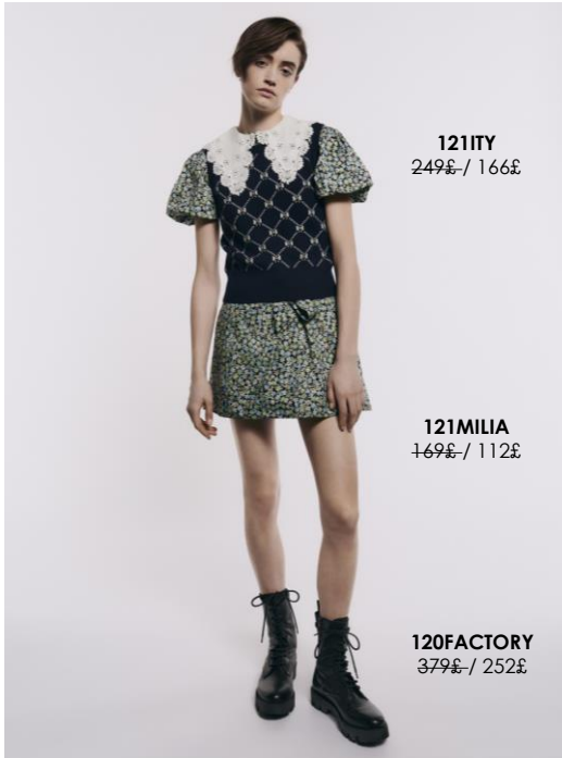
121ITY 249£ / 166£