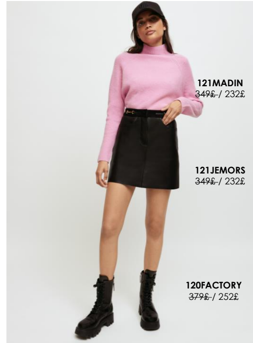
121MADIN 349£ / 232£