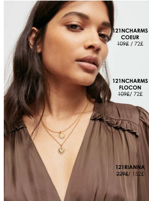
121NCHARMS COEUR 109£ / 72£