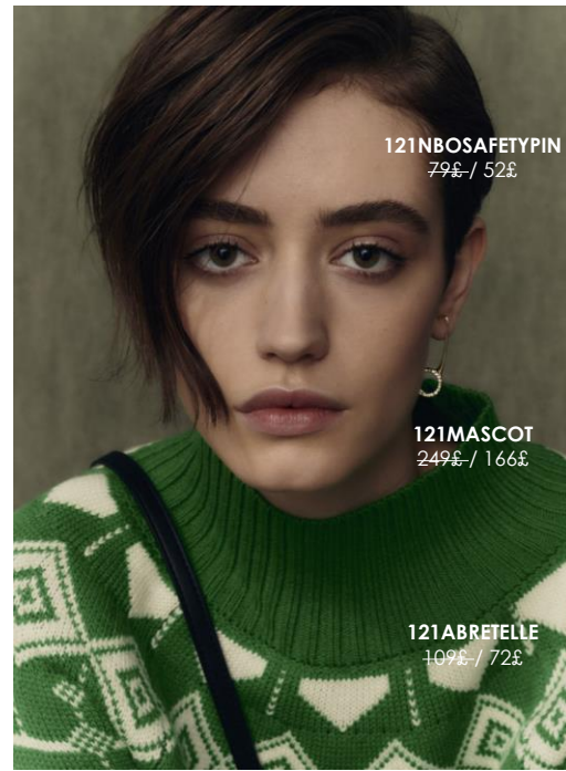
121NBOSAFETYPIN 79£ / 52£