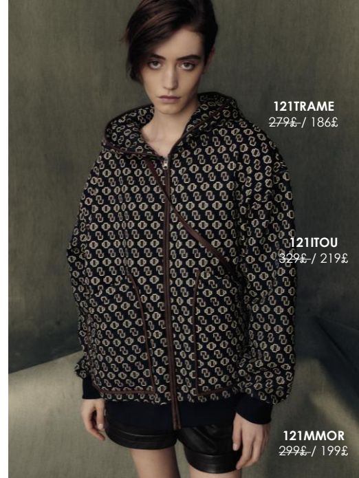
121TRAME 279£ / 186£