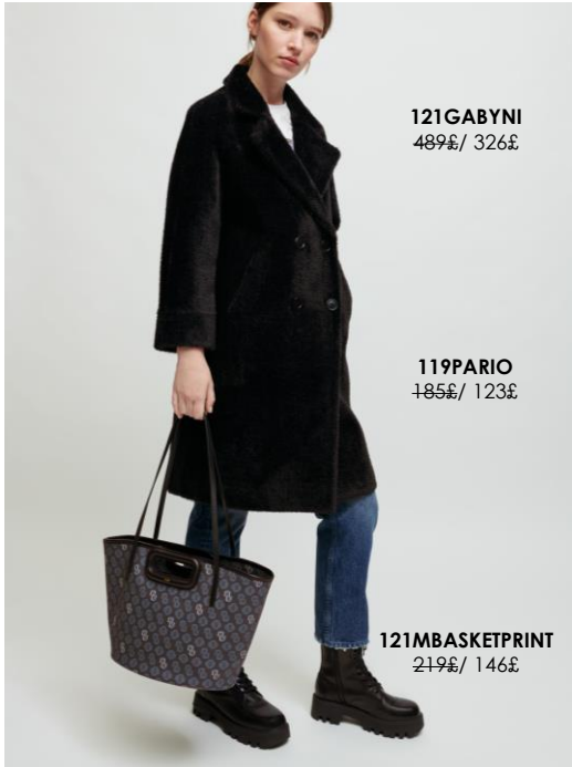
121GABYNI 489£/ 326£