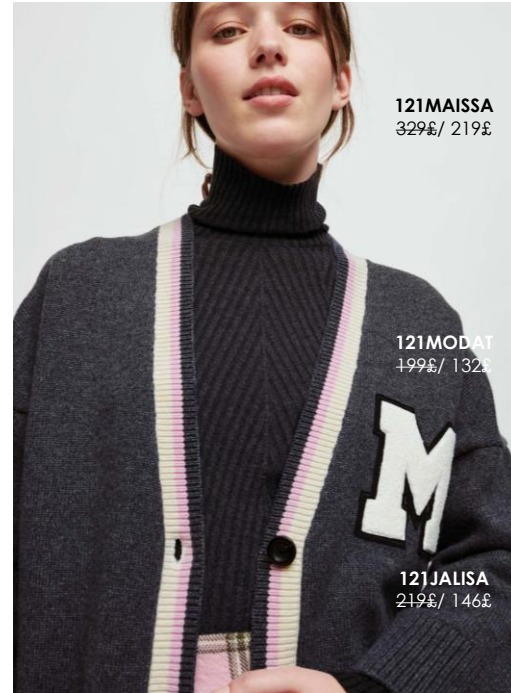
121MAISSA 329£/ 219£