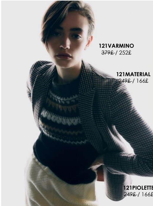
121VARMINO 379£ / 252£