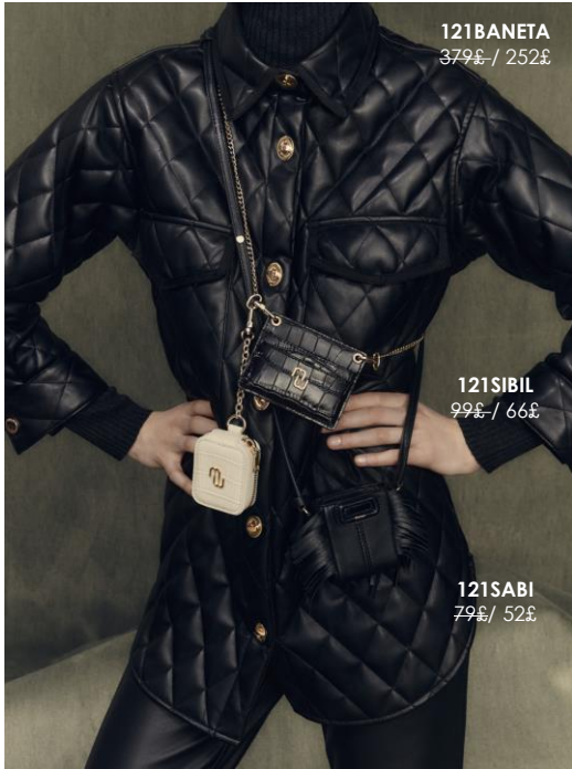
121BANETA 379€ - / 252£