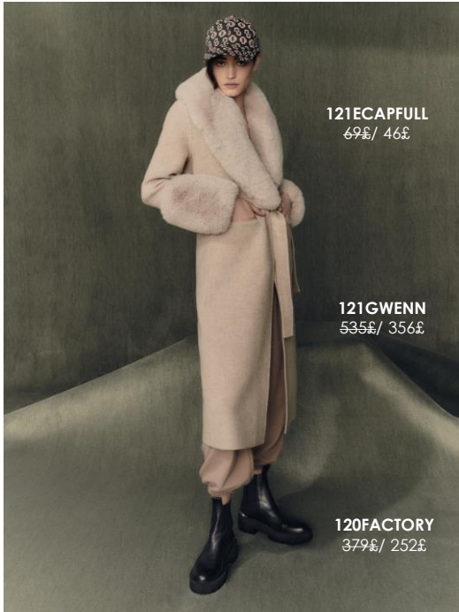
121ECAPFULL 69£ / 46£