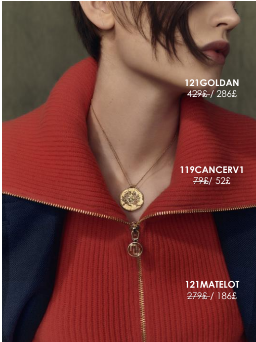
121GOLDAN 429£ / 286£